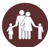
Families and Children

Caritas Singapore is the official social and community arm of the Catholic Church in Singapore and a member of Caritas Internationalis. We are the umbrella body for 28 Catholic charities and organisations whose work has touched the lives of many regardless of race or religion. Our causes cover: