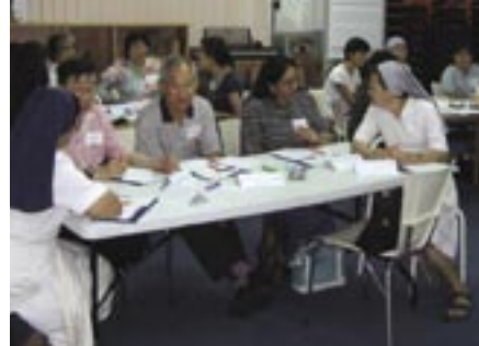
Volunteer Management Training, page 13