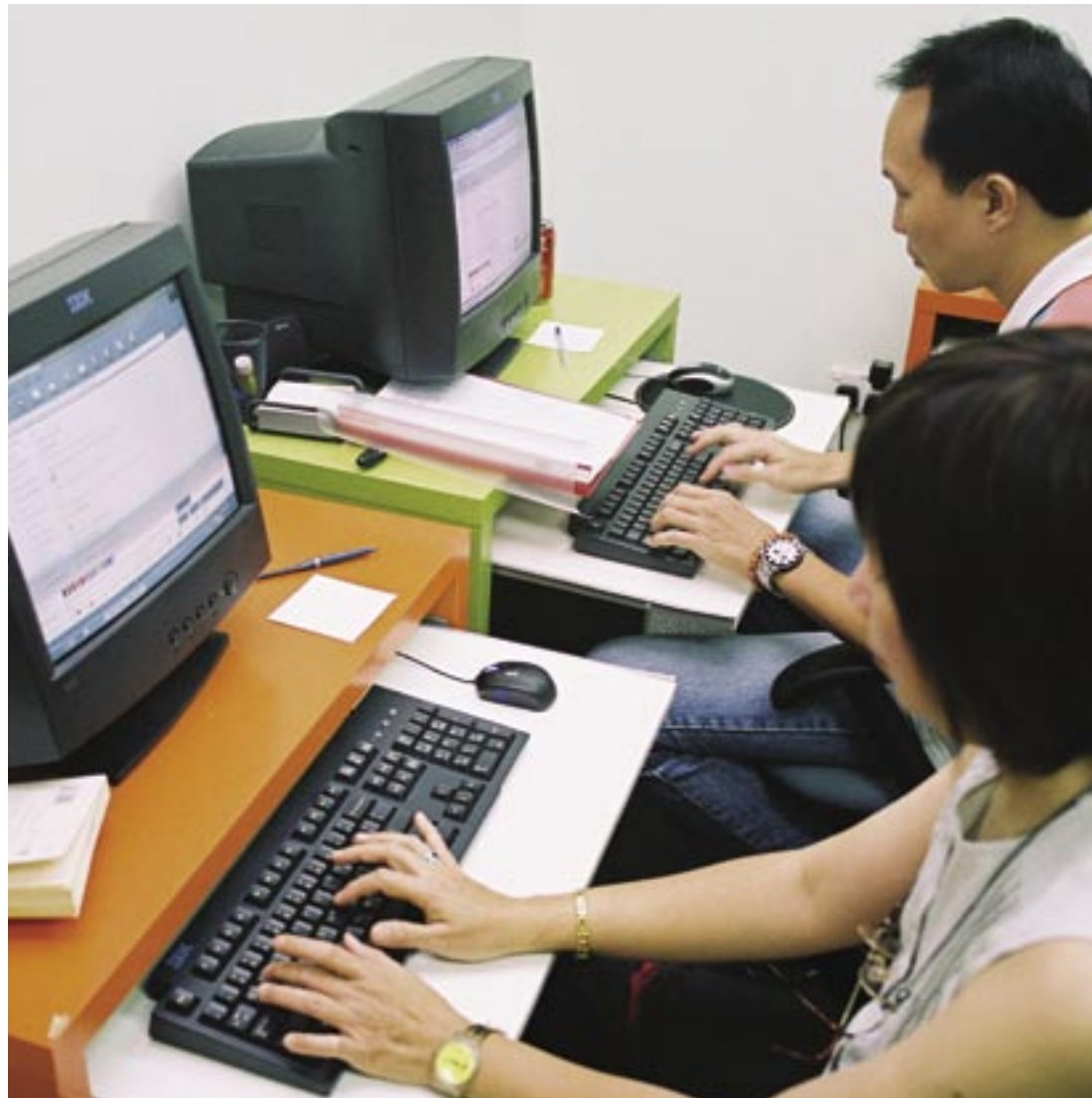
Marine Parade Family Service Centre cyber-counsellors at work on their computers.

CSCC is also extending its premises to provide meeting rooms and mail boxes to those member organisations that may have such needs.