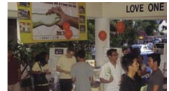
Volunteer Fair, page 13