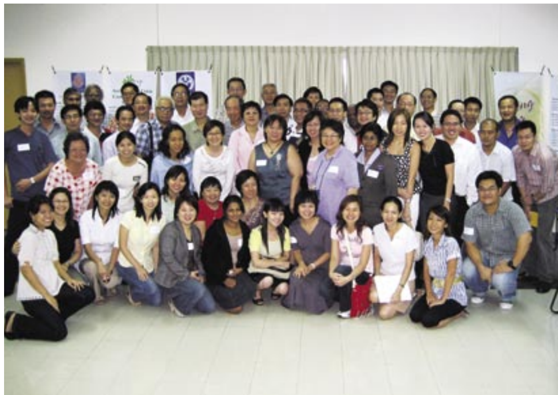
CSCC Parish Ambassadors' Briefing.

In September 2007, CSCC launched e-Update, an online newsletter for those actively involved with and interested in CSCC happenings.