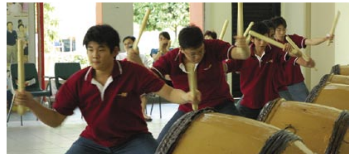
Youths at Poverello Teen Centre (a CWS project).