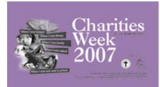
Lenten Fund Raising Campaign, page 14