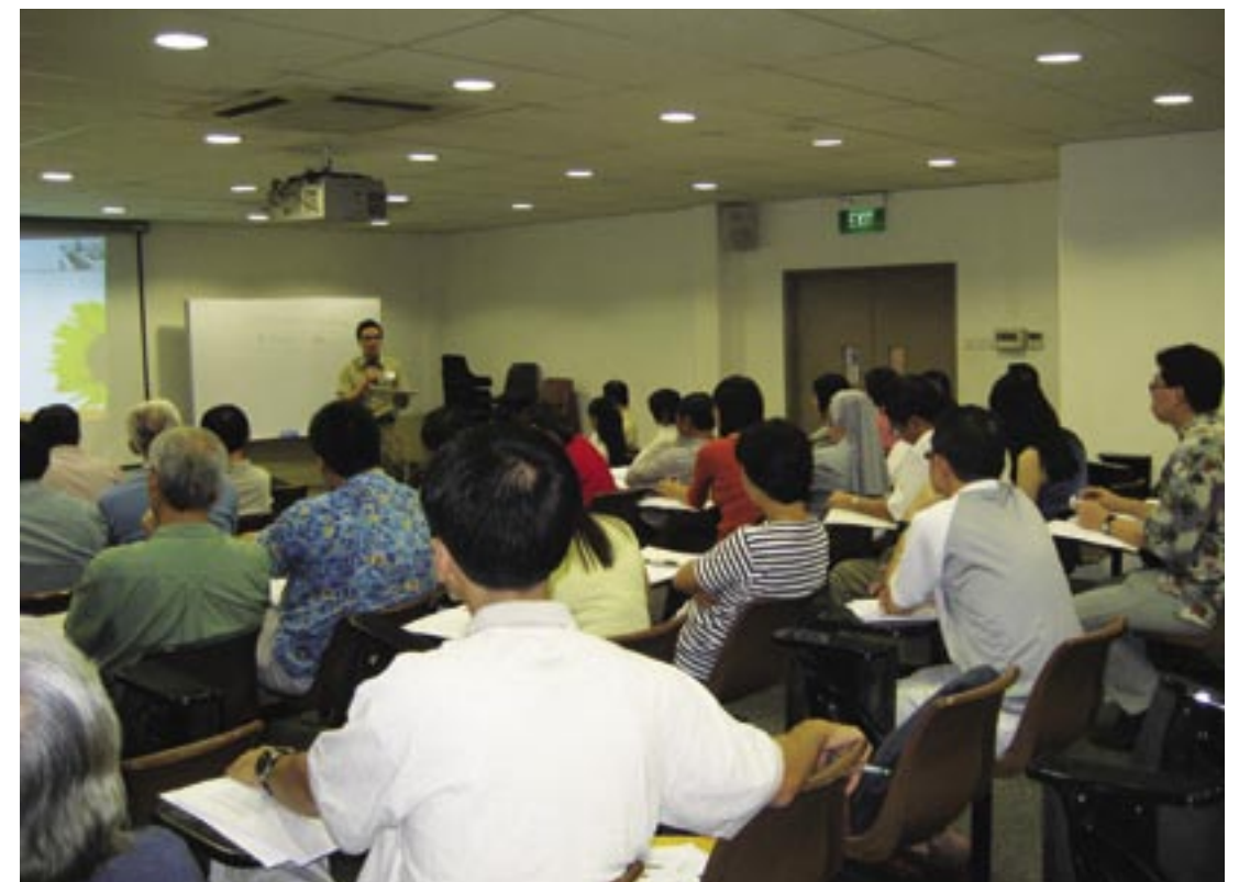
Members' Forum 2007.