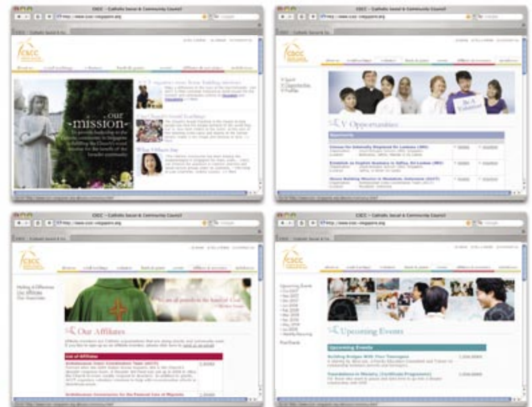
CSCC online portal.