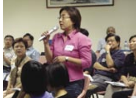
Members' Forum, page 21