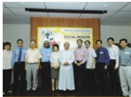
Launch of CSCC by Archbishop, page 1