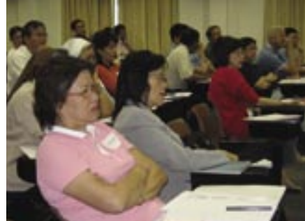
New Charity Rules Dialogue, page 21