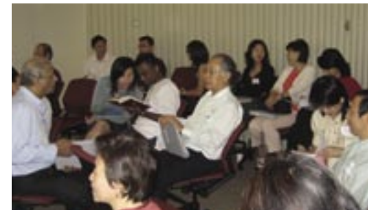
Committees at Planning Retreat, page 38