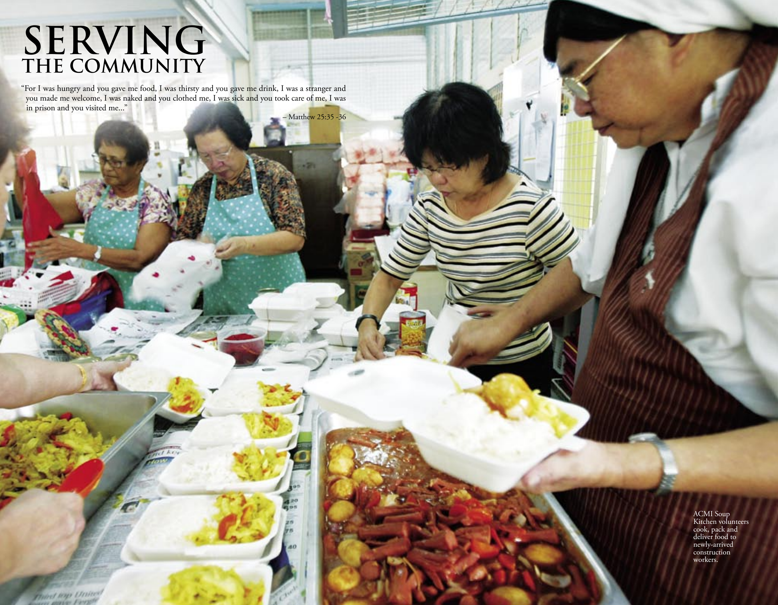
ACMI Soup Kitchen volunteers cook, pack and deliver food to newly-arrived construction workers.