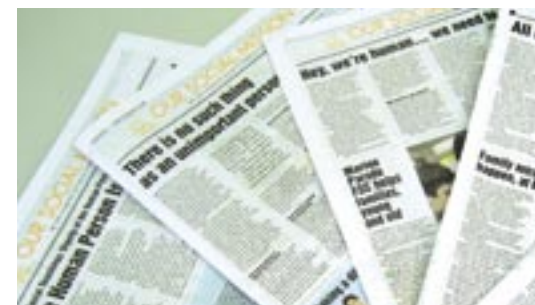
“Our Social Mission” series in Catholic News, page 16