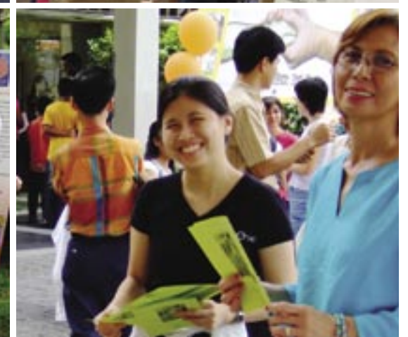
Clockwise from top left: Volunteer management training • Volunteer Fair at the Church of Sts Peter and Paul • Volunteer Fair at the Church of the Nativity of the BVM • Volunteer Fair at the Church of St Mary of the Angels.