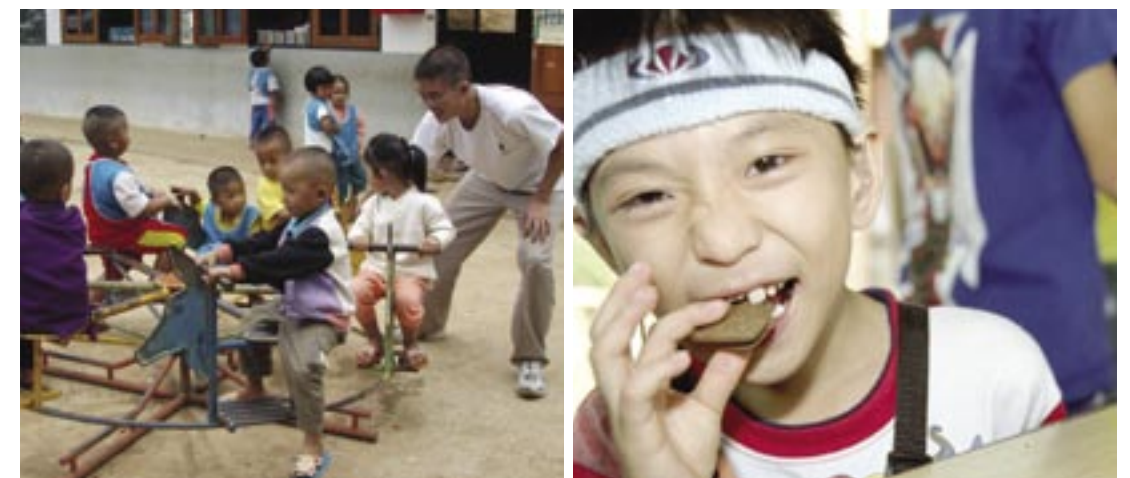
From left: A JRS volunteer with refugees. • A child from Canossaville Children's Home.