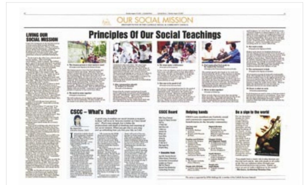
First issue of "Our Social Mission" page in Catholic News.