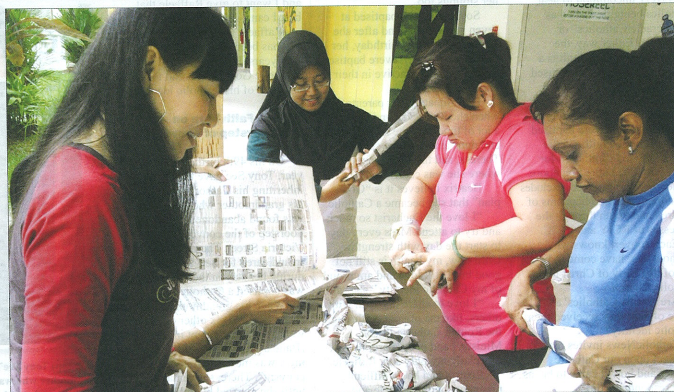
Innova team building: Family Life Society facilitated the team-building exercise for parents and teachers at Innova Primary School.