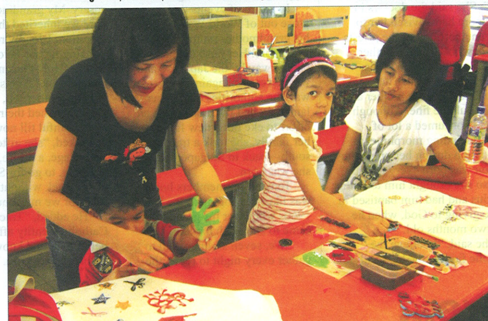
Pei Hwa Family Day: Paint Your Family T-Shirt Day at Pei Hwa Secondary School was organised by the Family Life Society.