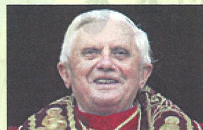
Pope Benedict XVI

God offers to us sinners the possibility of being forgiven. The fact of sharing with the poor what we possess disposes us to receive such a gift...By drawing close to others through almsgiving, we