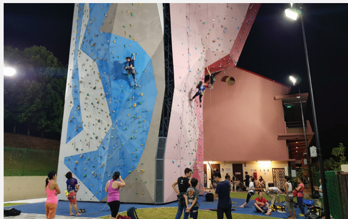
Rock Wall at Boys' Town Adventure Centre