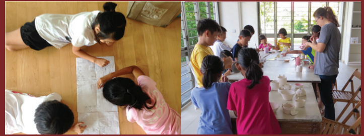
Education enhancement and arts and craft programmes