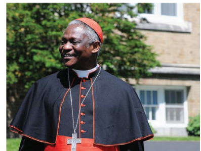
His Eminence Cardinal Turkson, first Prefect for the new Dicastery for promoting Integral Human Development

"It is not just a question of eliminating hunger and reducing poverty... it involves building a human community where men can live truly human lives."