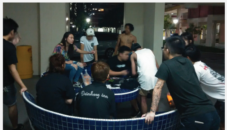
YouthReach workers befriending youths they meet on the streets

Boys' Town continues to evolve, staying relevant to better meet our society's needs.