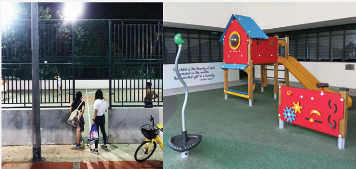
YouthReach staff visiting regular youth hangouts