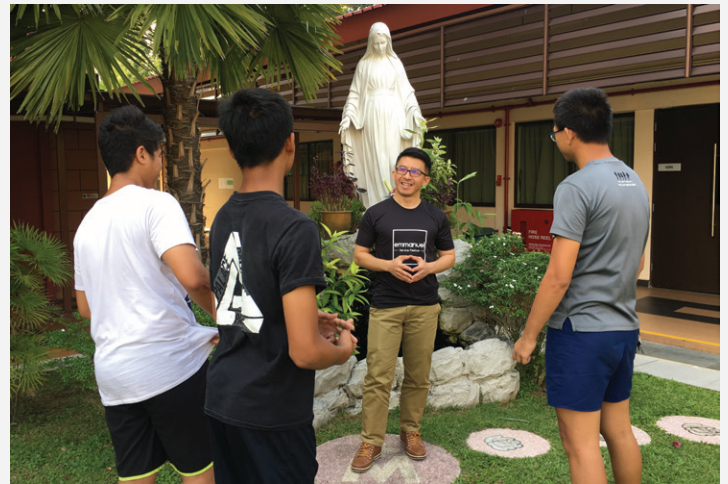
Roland's regular chat session with the boys in residence

Using various approaches and interest-based programmes, youth workers engage and build rapport with youths, connecting