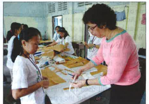
Your donations during Charities Week 2012 will help more than 50,000 beneficiaries of Caritas Singapore's member organisations. The work includes caring for people with HIV and AIDS, disaster work overseas, helping foreign workers to improve their skills, and journeying with those who need hospice care.

2012 will enable these organisations to continue doing their work. All proceeds will go towards a common chest to support the work of Caritas Singapore and its member organisations.