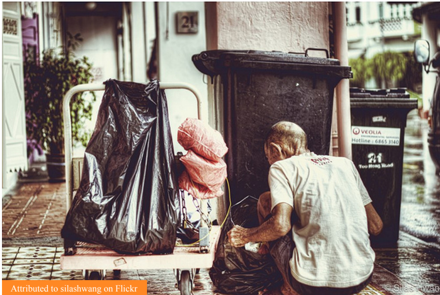
Attributed to silashwang on Flickr

- Forming Consciences for Faithful Citizenship: A Call to Political Responsibility, paragraph 13.